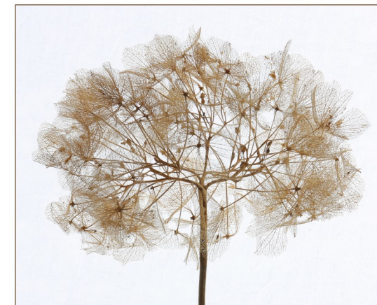
Winter Hydrangea

Meetings held on Wednesdays at 7.45 for 8.00 pm start at St John's Church Hall Eden Park Avenue, Beckenham, Kent, BR3 3JN